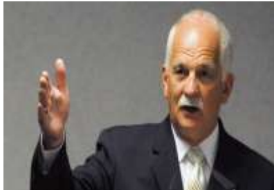
The Honourable Vic Toews (Keynote Speaker) Minister of Public Safety Representative of Provencher (Manitoba) Canada

Hon. Vic Toews was first elected to the House of Commons in 2000 and re-elected in 2004, 2006 and 2008. In February 2006, Mr. Toews was appointed Minister of Justice and Attorney General of Canada and in January 2007, was named President of the Treasury Board. Prior to his election to the House of Commons, Mr. Toews was active in Manitoba provincial politics. In 1995, he was elected as the Member of the Legislative Assembly for Rossmere and shortly thereafter, he was appointed Minister of Labour. From 1997 until September 1999, he served as the Attorney General and Minister of Justice for the Province of Manitoba. Mr. Toews graduated from the University of Winnipeg and received his law degree from the University of Manitoba.